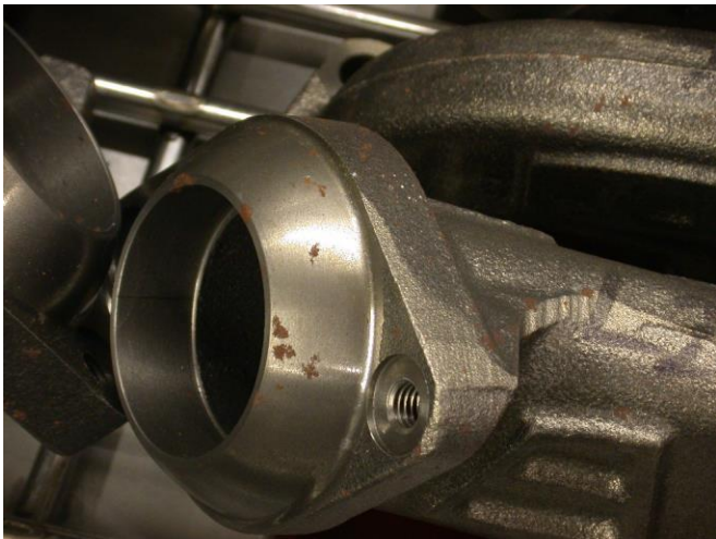
Machined Cast Iron with rust