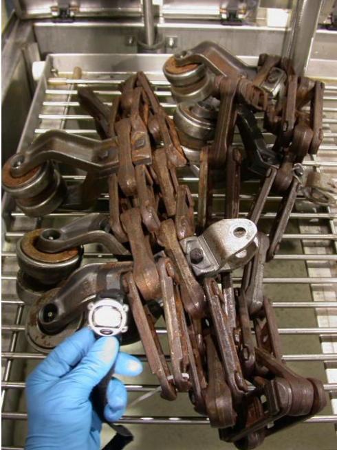
Rusted monorail chain