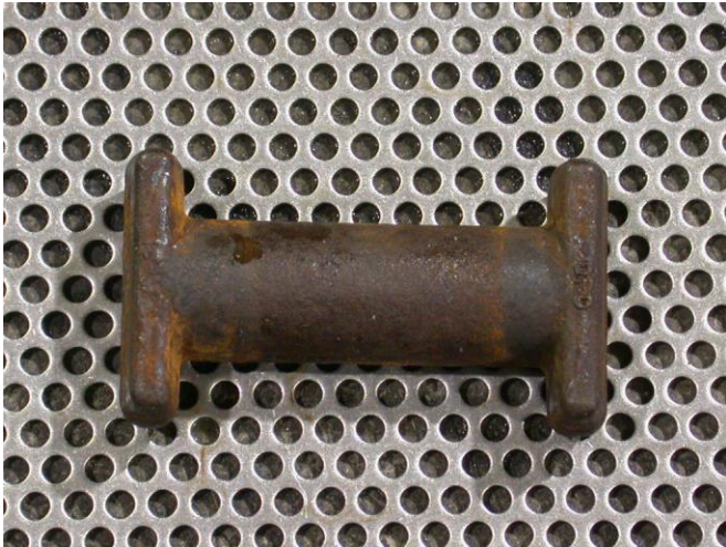
Close-up of rusted pin