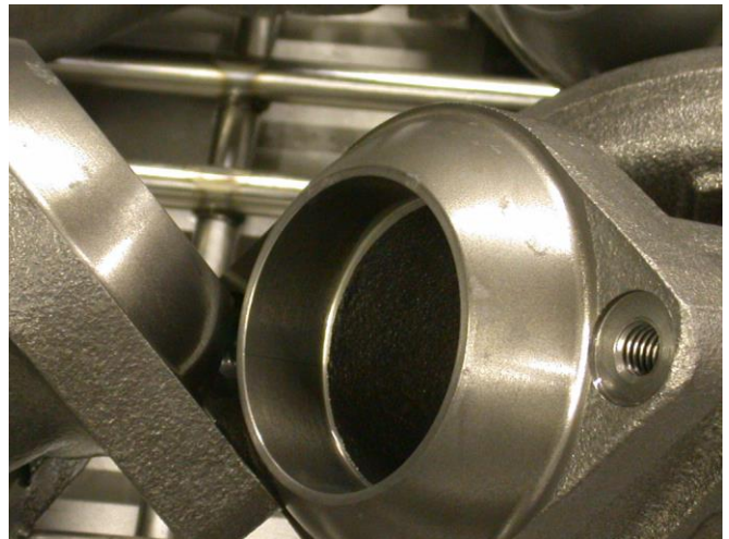
10 minutes later – no more rust inside or out