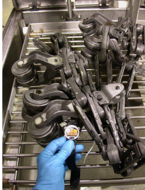
30 minutes later – looks like new